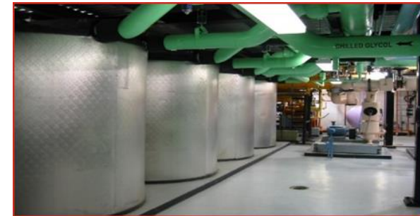
New York Class A Office 20 MW / 150 MWh in NYC